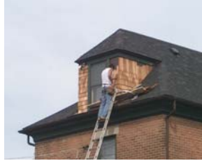
Deteriorated shingles & wood trim removed, replaced with new in same pattern & painted.