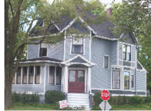
Power washed, scraped and repainted.