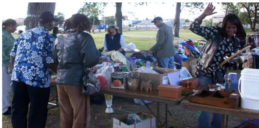
Happy Shoppers on Labor Day at NoMCO 's Rummage Sale during Maywood's Family Fest.