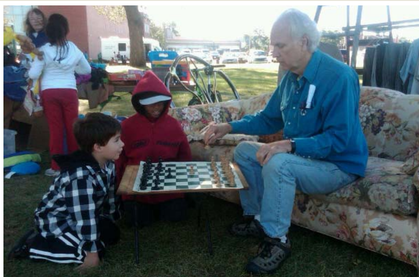
A couple of ole friends – taking a break before the crowds get to heavy – play for the "Championship of the World." By the way, the match didn't last too long; the couch sold shortly after the photo - for a bargain!