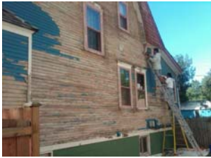
Old paint stripped with a heat gun. Old shingles removed and replaced with new.

This past month, 3 homeowners have taken to sprucing up their homes, each with a different process – and all with fabulous outcomes!