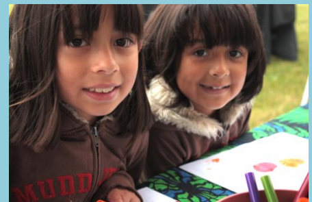
Kids will always find a fun craft or game when they come to the market

Please make all submissions for the NoMCO News to the editor at jylarkin@yahoo.com .