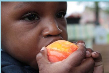
Who can resist a fresh, juicy peach?

Urban Garden Connection will have gardening activities for kids of all ages this summer. Kids share in the fun of growing vegetables, cooking, and eating along with crafts and outdoor games. The Maywood Multicultural Farmers Market at Maywood Library, 5th & St. Charles, 8:00am – 1:00pm you can buy fresh fruits and vegetables, honey, flowers and more. This season we'll have free cooking classes for kids, storytime, fun and games and raffle prizes for kids and adults plus a weekly walking club. For more information about the Urban Garden Connection Project, please call the Broadview Park District at 708-343-5637 or visit our website at www.urbangardenconnection.com