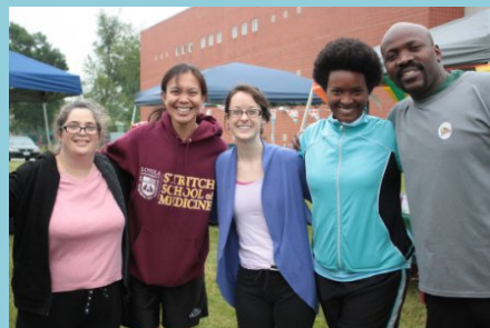
Walking Club: enjoying getting fit together!