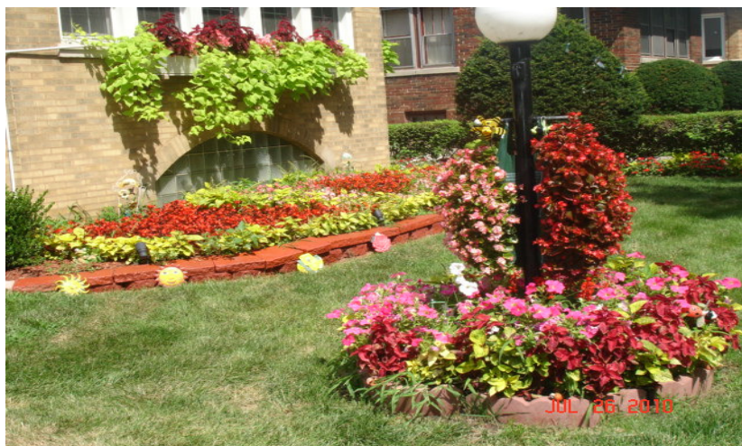
One of many nominated Maywood gardens in the 2010 Great Gardens Awards Program

Forms are available after July 1 st in the Village Clerk's office or at www.maywood-il.org , and must be turned in by July 29 th . Nominated gardens will be featured in the fall village newsletter, and owners/residents will receive a certificate of recognition from the Commission.